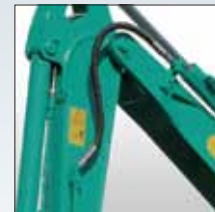
Auxiliary Hydraulic Piping (Standard)