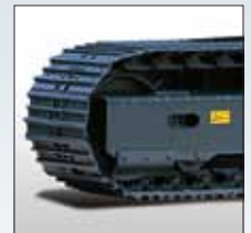
Steel Shoe (Optional)