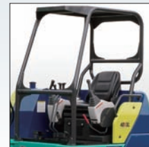
4 Post Canopy